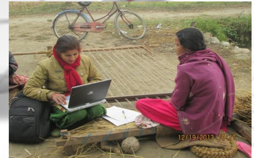
Interviewer conducts Interview in their country