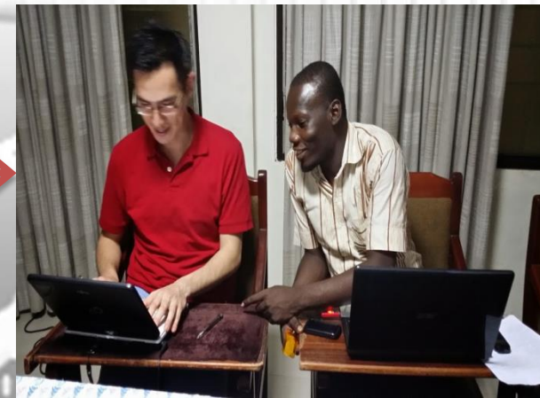
Managers monitor the data collection production in their country