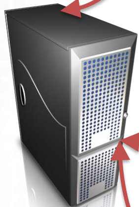
Survey Database at ISR